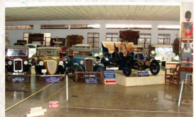
Vintage Car Museum A collection of vintage cars