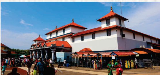
Shri Manjunatha Swamy Temple

Most renowned religious landmark with the history as old as 800 years