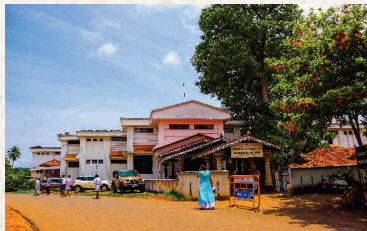
Manjusha Museum A collection of 21,000+ antiques