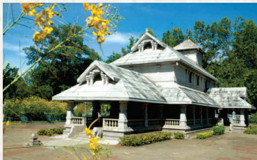
Shri Chandranatha Swamy Basadi Centuries old basadi in pristine condition

The majestic shrine of 39-feet positioned at the top of the Ratnagiri Hill