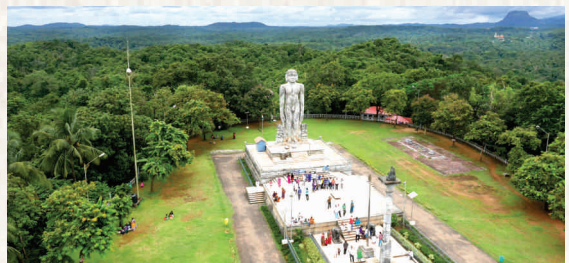
Lord Bahubali Statue

Most renowned religious landmark with the history as old as 800 years